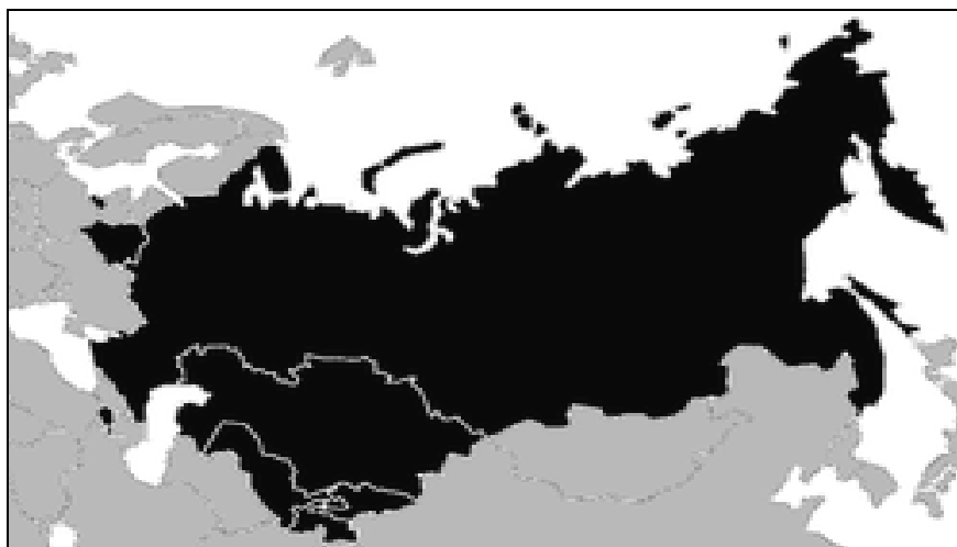
Figure 3: The Collective Security Treaty Organization.

CSTO (figure 3) is a security organization set up in 2001 on Russia's initiative, to be used in the case of "a big war in the region".