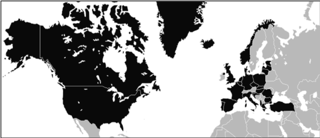
Figure 2. The dimension of the NATO between 1949 (12 members) -2009 (28 members) (source: http://en.wikipedia.org/wiki/Commons:Category:Maps_of_NATO )